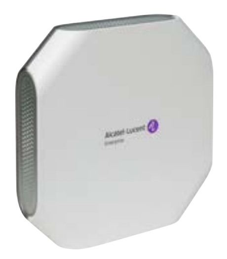
OmniAccess Stellar AP1101 indoor Wi-Fi access point