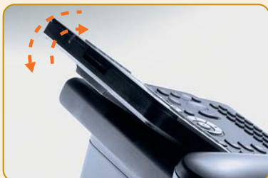
Fully adjustable display for a clear and comfortable viewing angle, from wherever you're looking.